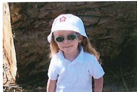
Wear a hat and sunglasses