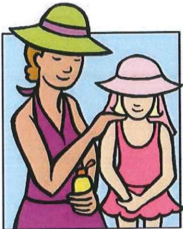
MS Office Clipartsunscreen

2. What can you rub all over your skin to protect yourself from the sun's rays?