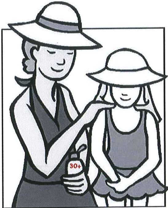
30 or more