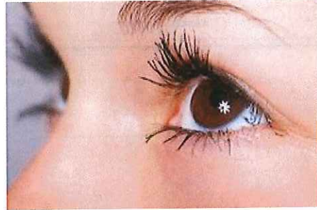
Pixabayyour skin and eyes

2. What can you rub all over your skin to protect yourself from the sun's rays?